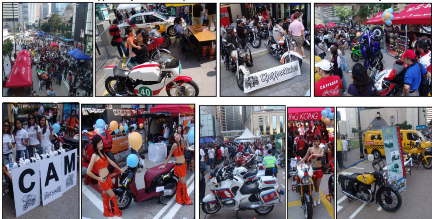
1.0 Numerous activities and Biking attractions at the 2006 Event

Like last year, the Show aims to be a mixing of every aspect of Motorcycling in Hong Kong from the ‘Harley Hogs’ to the Moto-Crossers, from the Police Bikes to Superbikes! Everything you need to know about Biking in Hong Kong will be on Chater Road on 4 th November, 2007. This is an opportunity for Bike Shops and Clubs to show themselves to the HK Community!